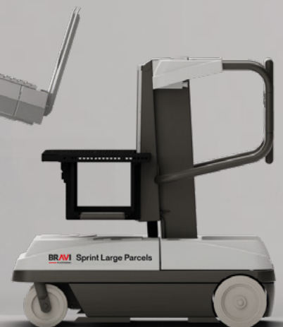
Sprint Large Parcels