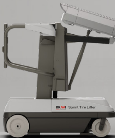
Sprint Tire Lifter