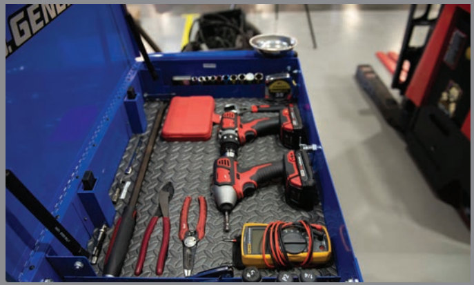
Visualization and 5S practices on display at The Raymond Corporation's Malin Solutions and Service Center in Addison, Texas.