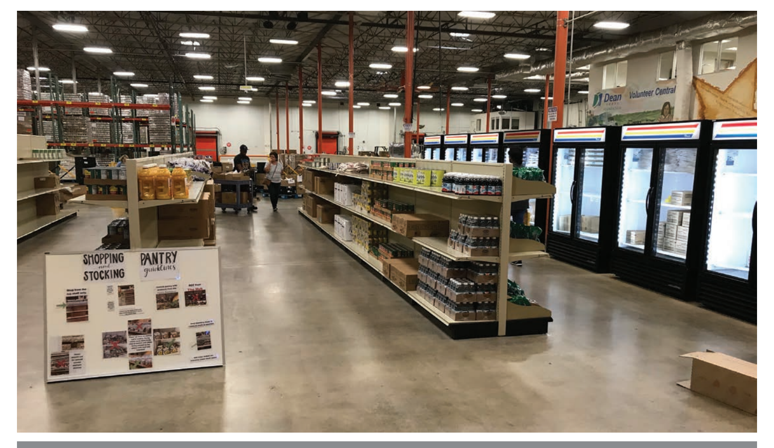
Located in Dallas, Crossroads Community Services optimized one-way shopping lane features 110-120 SKUs and eliminates the need for shoppers to backtrack for missed items.