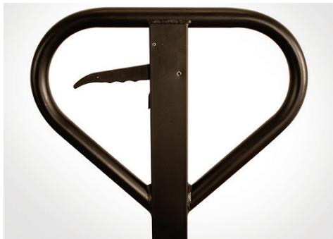
Teardrop handle with 3-way position lever for load control.