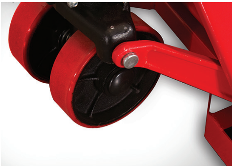
Polyurethane on steel core load and steer wheels.

Every operation runs differently. That's why the Altra Lift is designed to adapt to a wide range of operations and is available in a variety of configurations.