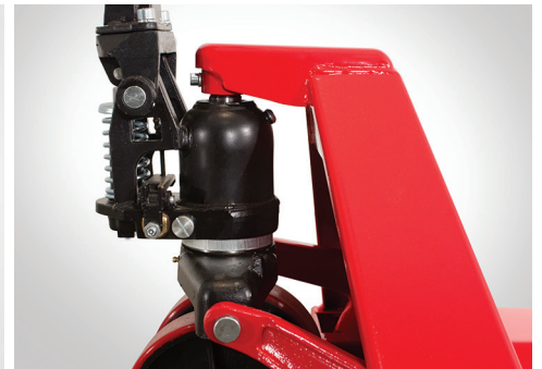
Hydraulic pump with over-load bypass valve.