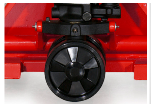
The unit is equipped with rugged black nylon wheels and steel load rollers

By design, the Low- and Ultra-low can access pallets of skids with low clearance openings.