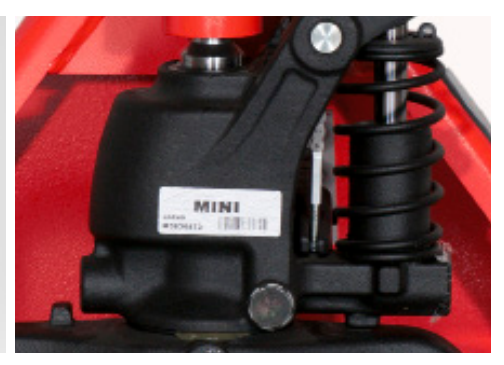
One-piece cast hydraulic pump