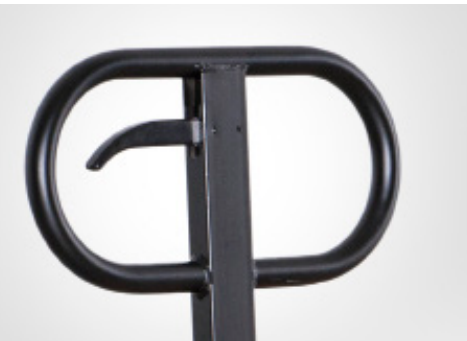
Three position fingertip control lever