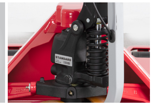
Durable powder coat paint finish